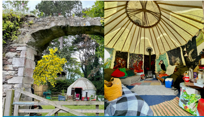
Herbspace: a sanctuary for young people - nestled in the gardens at Abbey Nursing Home, North Berwick.